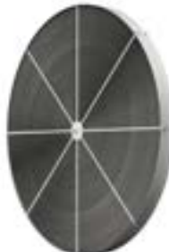
Segmented Replacement Wheel