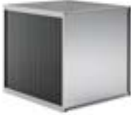
Wide Range of Options