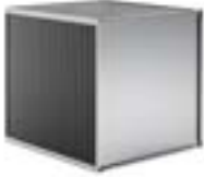
Very High Efficiency