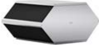
Twin Cross Flow