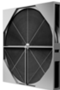
Segmented Wheel with Casing

CALCULATE WITH HEATEX SELECT FREE CALCULATION SOFTWARE